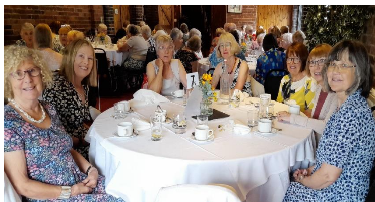
We dined with Walmley WI at Grounds Farm, Wishaw.