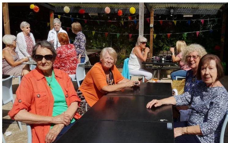
Boldmere met at the Deli in Boldmere for Coffee.