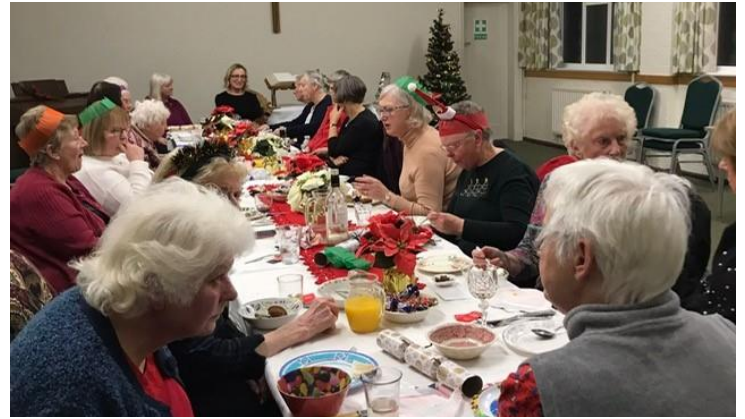
Above: Christmas Party in the Baptist Church Hall.